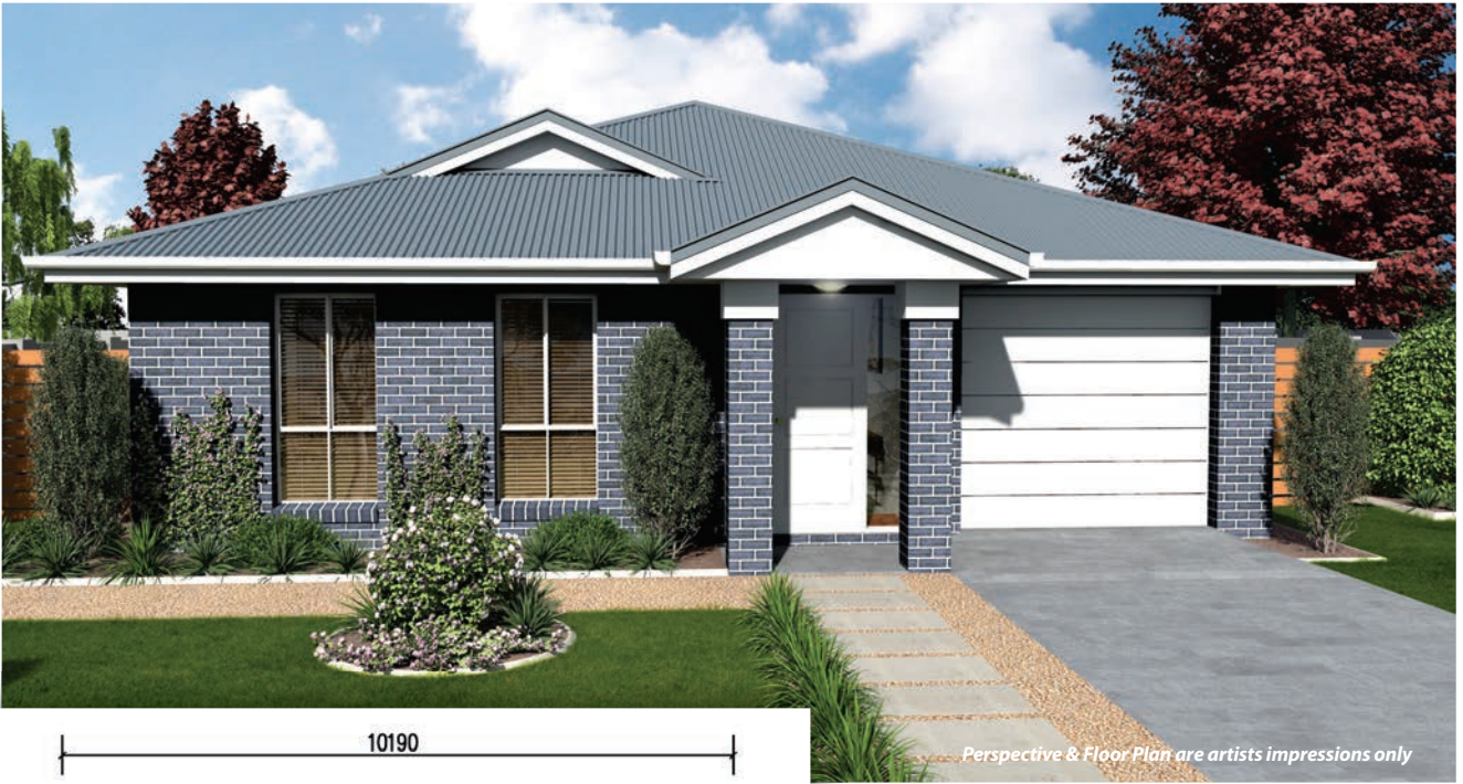
Perspective & Floor Plan are artists impressions only