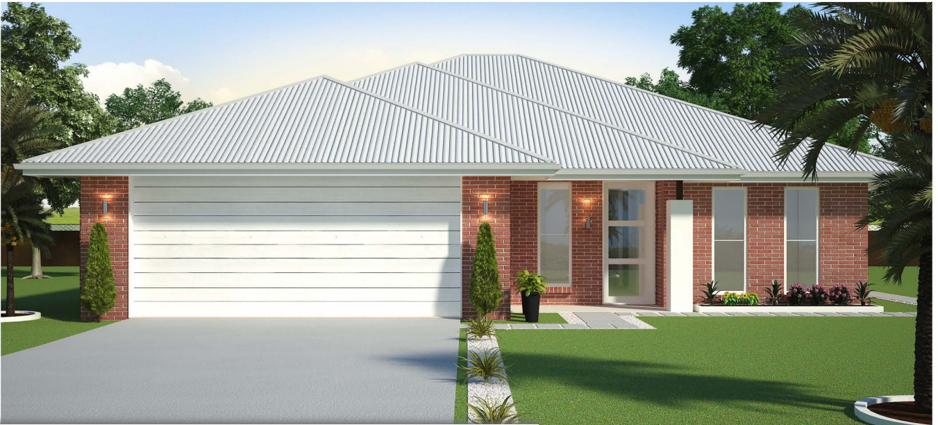
Perspective & Floor Plan are artist impressions only