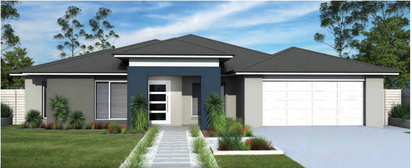
Perspective & Floor Plan are artists impressions only