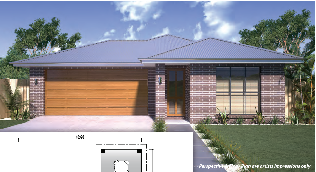
Perspective & Floor Plan are artists impressions only