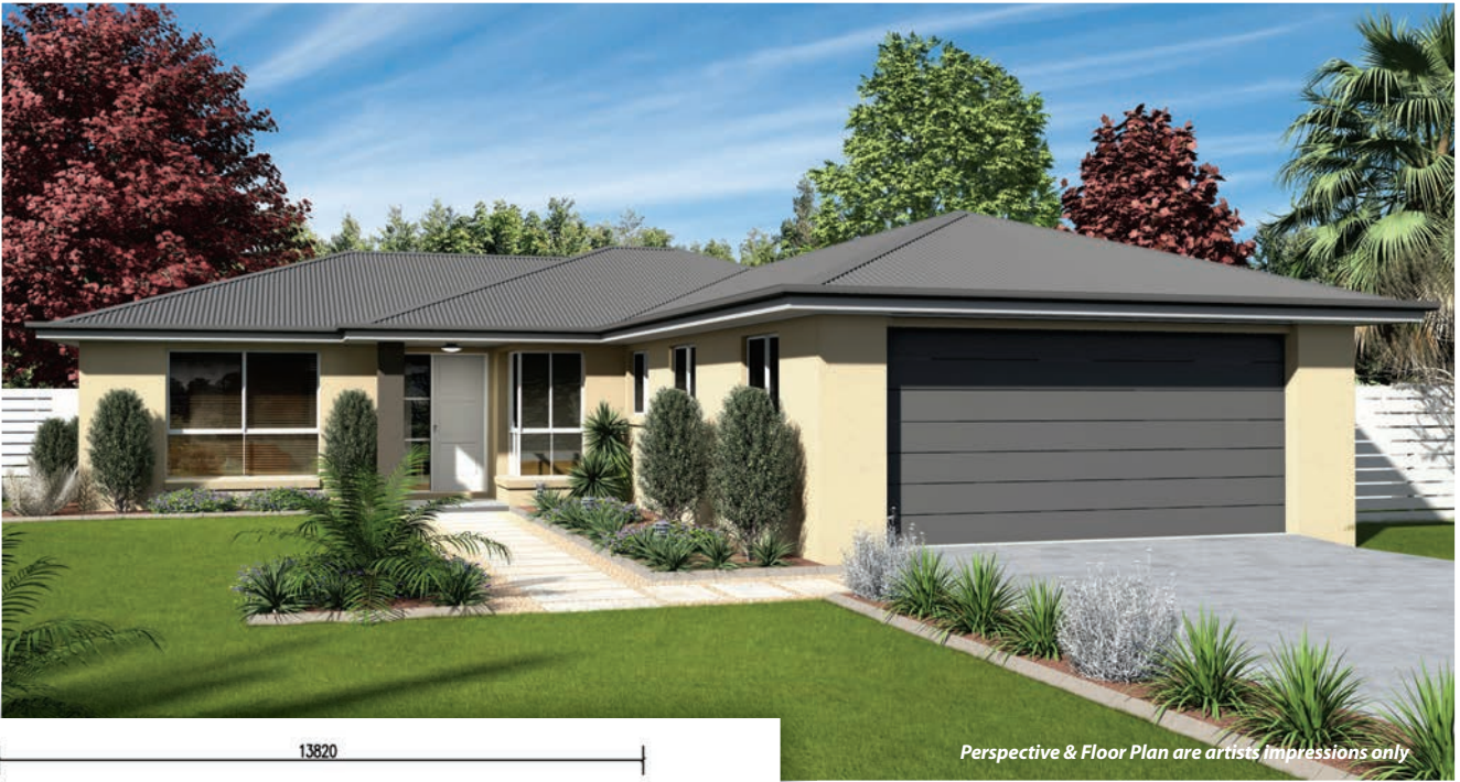
Perspective & Floor Plan are artists impressions only