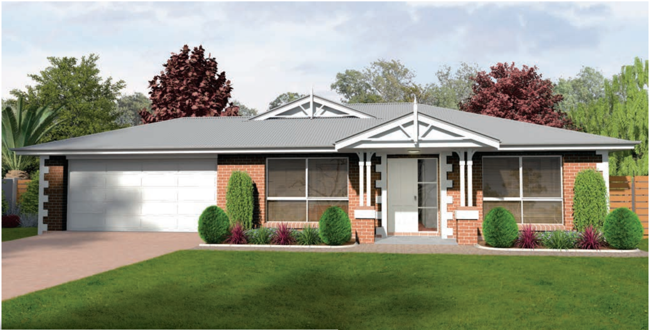
Perspective & Floor Plan are artists impressions only