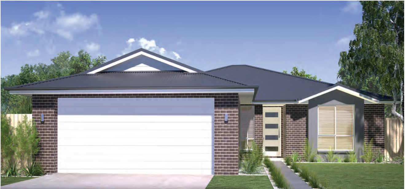
Perspective & Floor Plan are artists impressions only