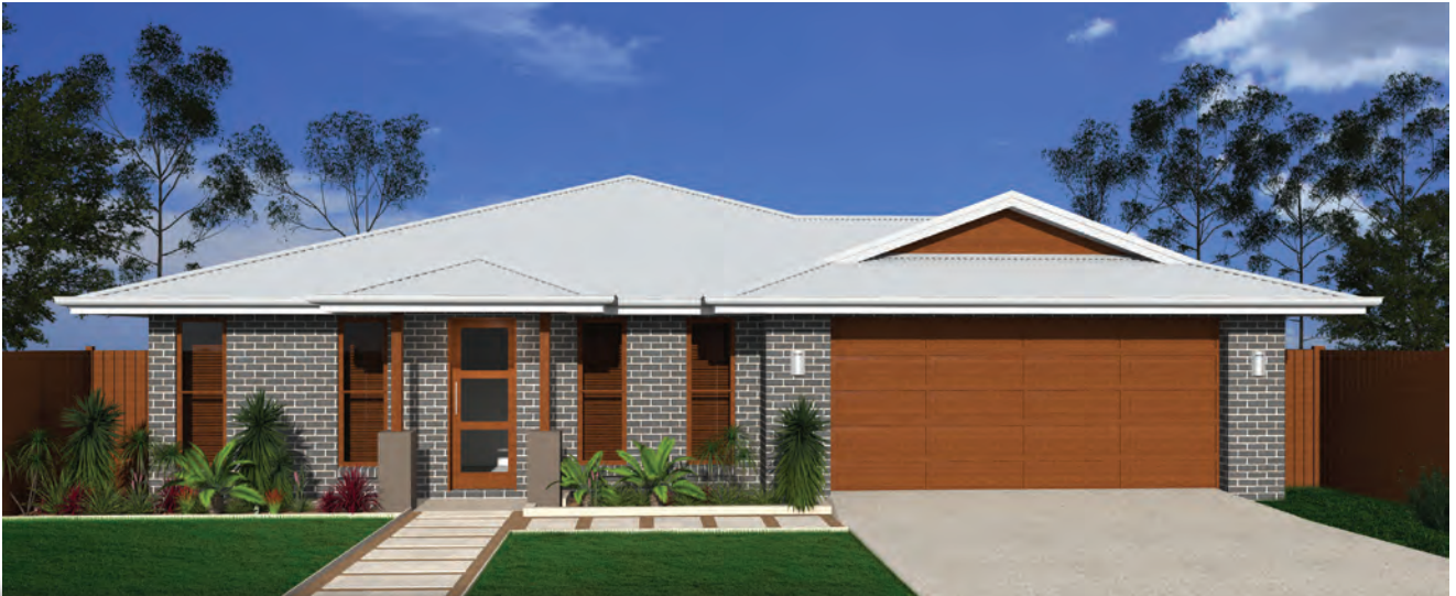
Perspective & Floor Plan are artists impressions only