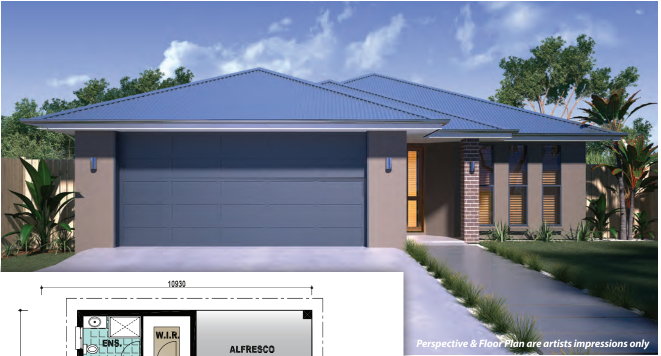
Perspective & Floor Plan are artists impressions only