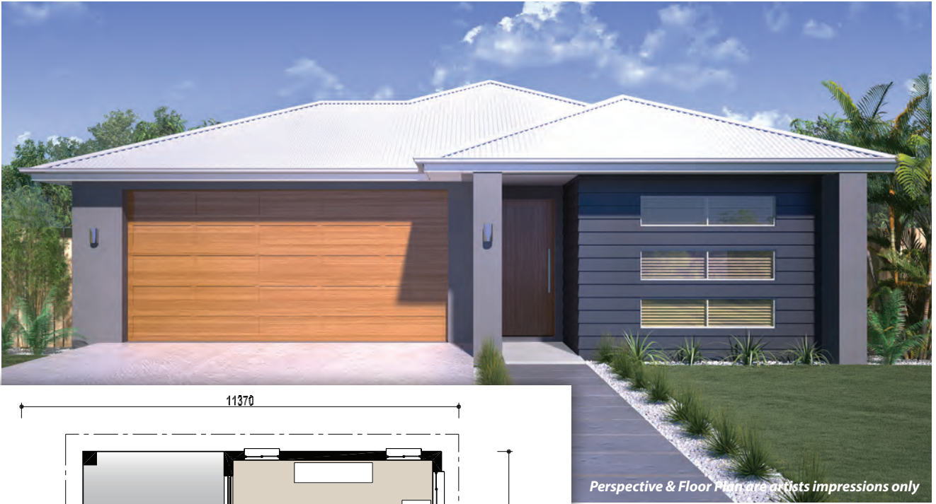
Perspective & Floor Plan are artists impressions only