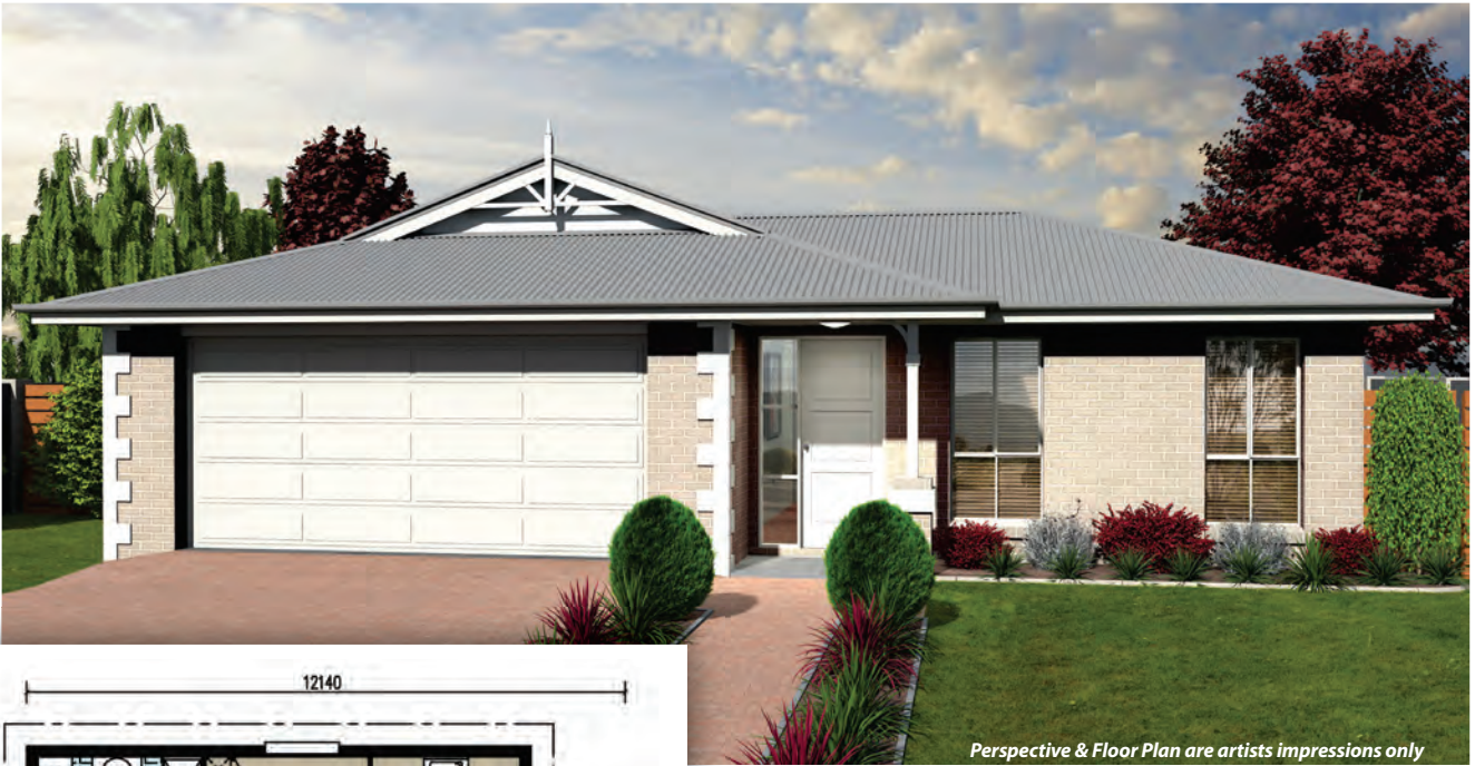
Perspective & Floor Plan are artists impressions only