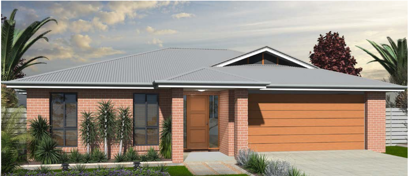
Perspective & Floor Plan are artists impressions only