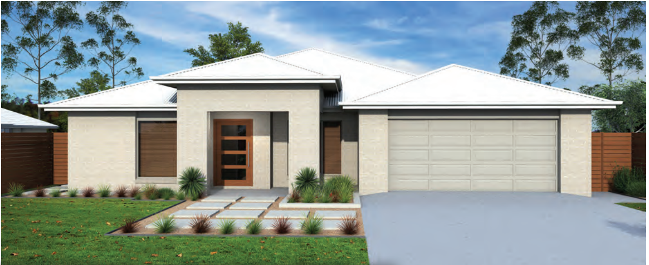
Perspective & Floor Plan are artists impressions only