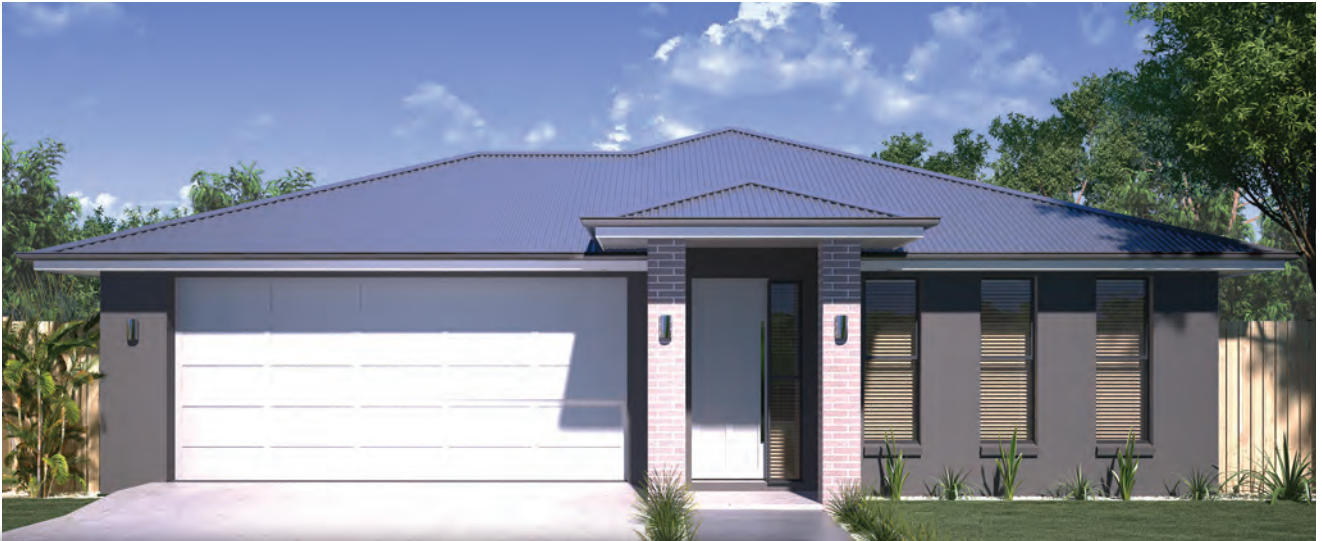
Perspective & Floor Plan are artists impressions only